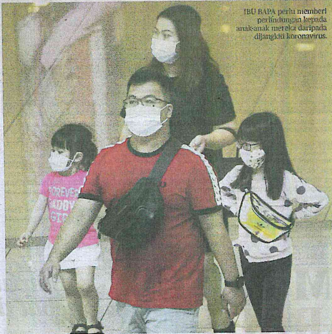
IBU BAPA perlu memberi perlindungan kepada anak-anak mereka daripada dijangkiti koronavirus.

Kementerian Kesihatan Malaysia (KKM) memaklumkan terdapat 317 kes positif Covid-19 dalam kalangan kanak-kanak 12 tahun ke bawah sehingga semalam. Ketua Pengarah Kesih-