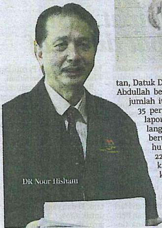
DR Noor Hisham

tan, Datuk Dr Noor Hisham Abdullah berkata, daripada jumlah itu, 112 kes atau 35 peratus adalah dilaporkan dalam kalangan kanak-kanak berusia empat tahun ke bawah dan 22 kes membabitkan bayi berusia kurang setahun. "Setakat ini tiada kes kematian positif Covid-19 direkodkan da-