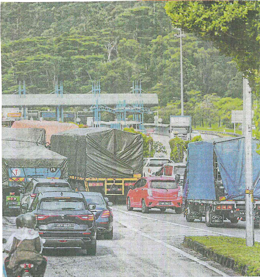
Traffic movement at the Gombak Toll Plaza east coast bound yesterday.

AKHBAR : NEW STRAITS TIMES MUKA SURAT : 3 RUANGAN : STORY OF THE DAYS/ NEWS