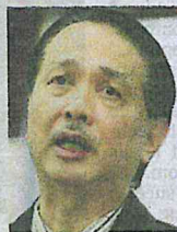
Datuk Dr Noor Hisham Abdullah

"She tested positive for Covid-19, although the cause of death was lung cancer."