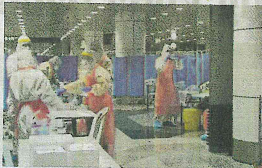
Petugas barisan hadapan di Lapangan Terbang Antarabangsa Kuala Lumpur bersiap sedia untuk menjalankan saringan ke atas semua penumpang yang tiba dari luar negara.

Mengulas lanjut, beliau berkata, ibu bapa dan penjaga perlu memberi didikan kepada kanak-kanak supaya dapat mengamalkan tahap kebersihan yang